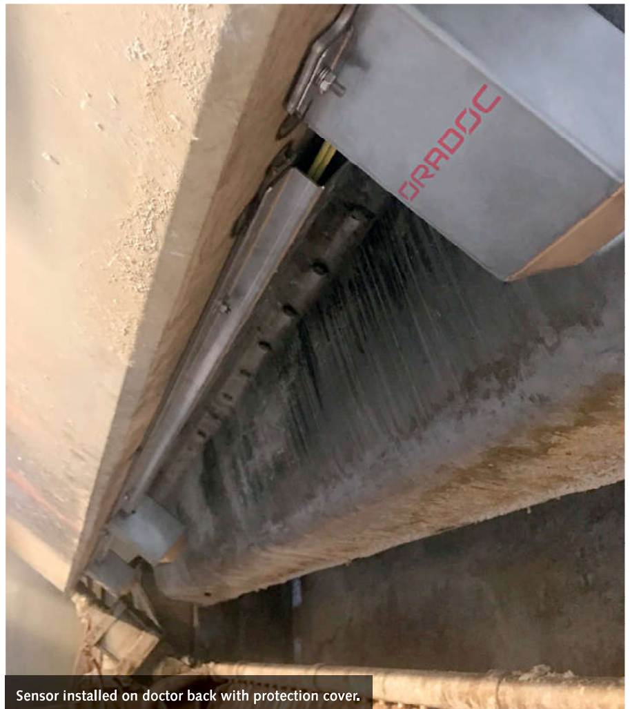
Sensor installed on doctor back with protection cover.

stage. As case histories have brilliantly shown over time, the OraTec™ FX system - along with the Remote Monitoring Service - allows to detect and solve a wide range of different possible issues concerning either the paper machine or the creping process. On one case, for example, the system was able to detect an unstable vibration that lead to a failure in the basis weight control system and that was due to uneven hoods temperature regulation. In another situation, thanks to its high sensibility to vibrational roots near the creping doctor and by monitoring in particular the time trend analysis, the